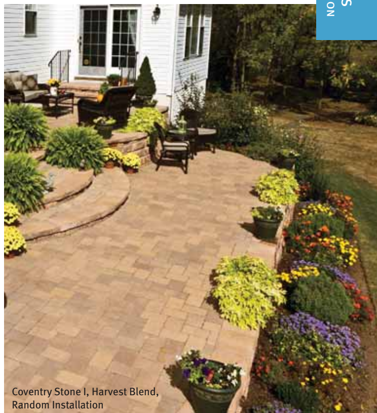
Coventry Stone I, Harvest Blend, Random Installation

Remember, you are liable for all damage and repair costs if you do not call!